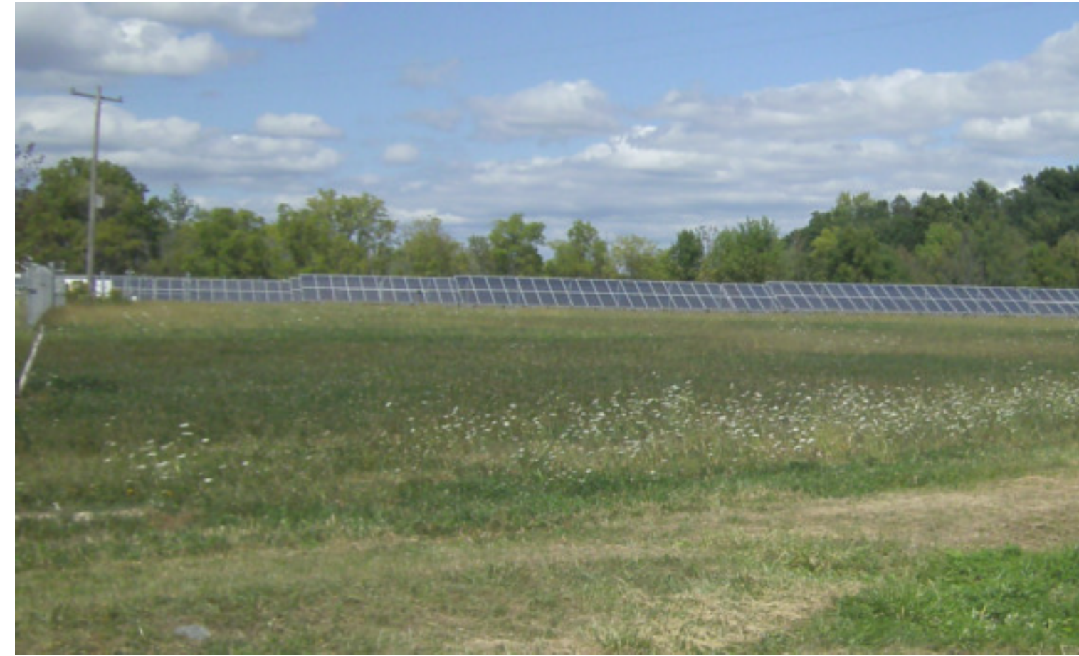
EXAMPLE OF GROUND MOUNTED SOLAR ARRAY IN FIELD