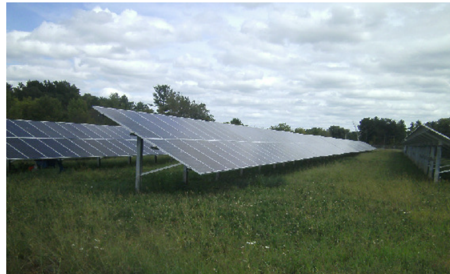
EXAMPLE OF GROUND MOUNTED SOLAR RACKING